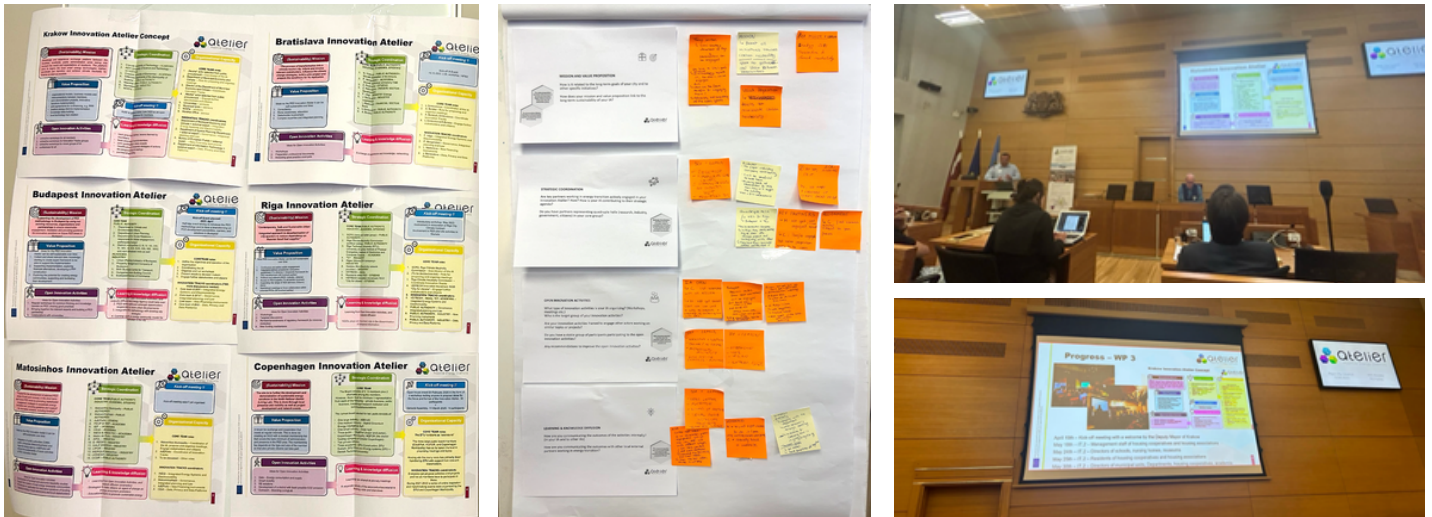
Example of ATELIER Fellow cities adoption of the M&E framework and tool