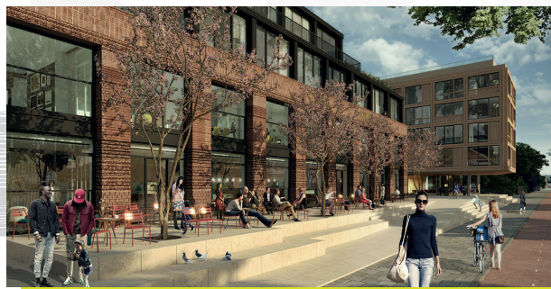
Lighthouse City Amsterdam.

Amsterdam is transforming a former industrial neighbourhood into a low-carbon, smart PED with mixed uses to explore opportunities for local energy communities: new energy efficient buildings, a high share of renewable energy sources generating solutions and smart technology will be deployed. Citizens are involved in the design of the environment (e.g. the car sharing facilities) and evaluations of the various demonstrators.