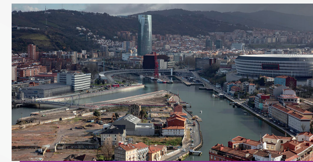
Lighthouse City Bilbao.

The demo district of Zorrotzaurre is an industrial brownfield that will become a city lab where the city of the future will be designed. On this island, new policies are being developed to foster a transition towards a zero-emission city model, including initiatives in transportation, heating and cooling and power generation, distribution and management. The aim is to develop 5,500 new homes, 150,000 m 2 of office space, 154,000 m 2 of citizen spaces and 93,500 m 2 of social and cultural facilities. The local PED will be developed in three locations as part of Zorrotzaurre island: North, Centre and South, which will be connected via a geo-exchange loop.